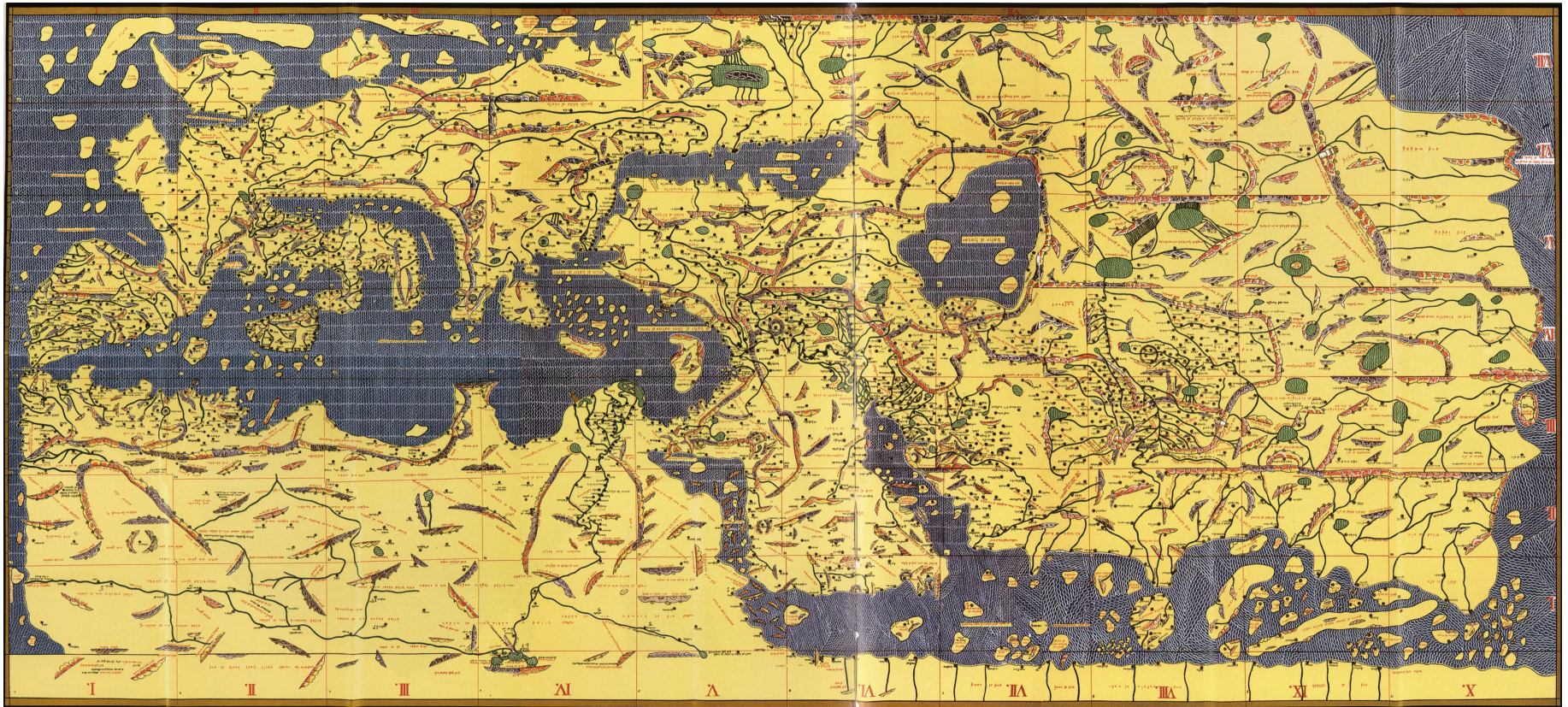
The map of the Arab I-Idrisi (1150). Flat. But with a grid, and north is up.

By the mid-twelfth century (1150), even before the general revival of Ptolemy in Europe , when the Arab geographer Al-Idrisi made his world map for Roger II, Norman king of Sicily (a Viking!!!), he too used a grid scheme which, like that on Chinese maps, makes no allowance for a curved earth.