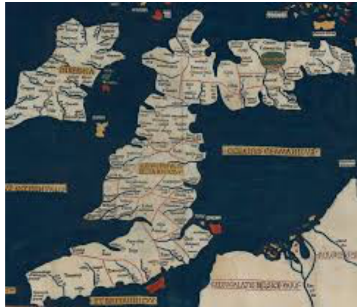
Ptolemy's maps of Europe and England in 150 CE using Hipparchus' geography. Accounted for a spherical Earth.