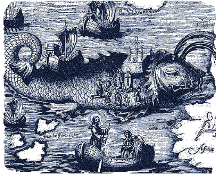
Scenes from Saint Brendan's Terrestrial Paradise