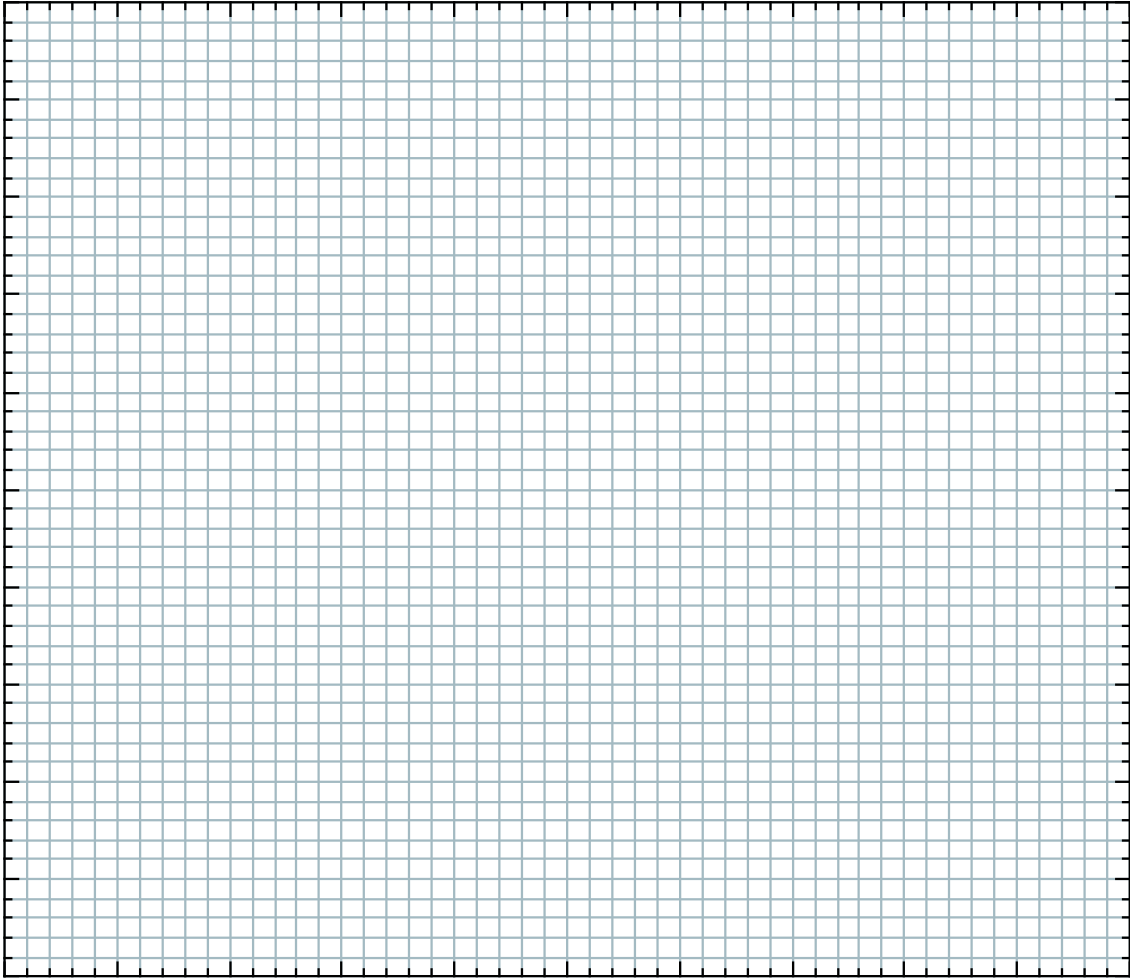
Figure 1.4: Graph paper for plotting the hourly temperatures in Tucson and Honolulu.

One of our primary goals this semester is to help you develop intuition about our solar system. This includes recognizing if an answer that you get “makes sense.” For example, you may be told (or you may eventually know) that Mars is 1.5 AU from Earth. You also know that the Moon is a lot closer to the Earth than Mars is. So if you are asked to calculate the Earth-Moon distance and you get an answer of 4.5 AU, this should alarm you! That would imply that the Moon is three times farther away from Earth than Mars is! And you know that’s not right.