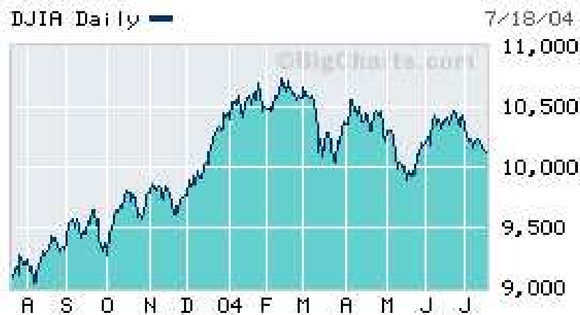
Figure 1.2: The change in the Dow Jones stock index over one year (from April 2003 to July 2004).